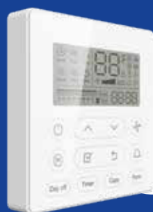
Compatible controller – Model KJRSAALW1 (Wi-Fi enabled)

Whether you choose the new touchscreen thermostat or compatible controller, you can trust your Elios contractor to help you choose the model best suited to your needs.