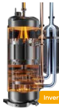
Inverter driven compressor

Central-Elios' advanced Inverter technology brings temperature control to the next level by allowing the compressor to operate at variable speeds, adjusting its output to precisely meet heating or cooling needs. For home and business owners, this means less energy use, extended system life, and quieter, more consistent performance.