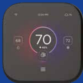
Touchscreen thermostat – Model ST1S42RW1 (Wi-Fi enabled)